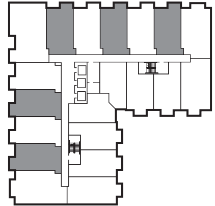
TYPICAL FLOOR PLAN AD3